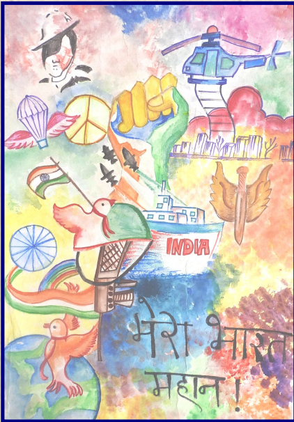
Sharvari Chopade (VII)